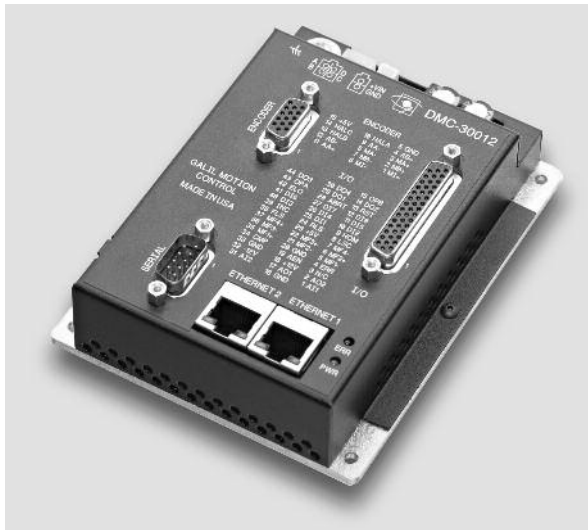
DMC-30012 Single-axis Controller and 800 W Brushless Sine Drive

Features include PID compensation with velocity and acceleration feedforward, program memory with multitasking for concurrent execution of four programs, and uncommitted optically isolated inputs and outputs for synchronizing motion with external events. Modes of motion include point-to-point positioning, jogging, contouring, PVT, electronic gearing and electronic cam.