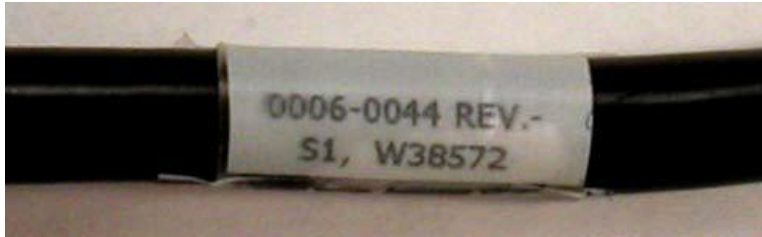
Figure 4: Version 1 of the CABLE-44-M-Xm showing part number and sheath.