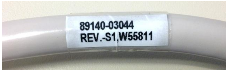
Figure 1: Version 3 of the CABLE-44-M-Xm showing part number and sheath type.