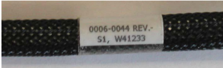
Figure 3: Version 2 of the CABLE-44-M-Xm showing part number and sheath.