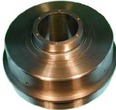
Figure 2 Allied Motion CM 5000 motor