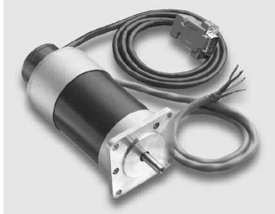
Figure 2 Galil BLM N23